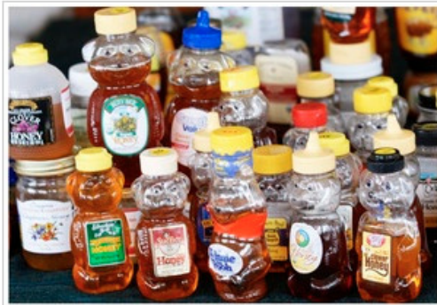
More than 1,100 brands of honey are sold in the U.S. These are some of the brands Food Safety News had analyzed to see if the pollen had been removed.

But the negative stories on the discovery of tainted and bogus honey raised her fears for the public's perception of honey.